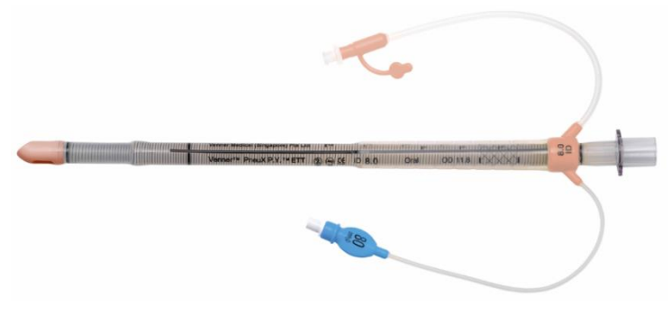
Figure 2 Venner PneuX™ device - an advance airways protection system

An advanced airways protection device consists of a flexible ETT with ports for subglottic suction/irrigation as well as a port to attach to an electronic system to maintain cuff pressure. The Venner PneuX<sup>™</sup> device was recommended for testing in a large scale clinical trial by NICE in MTG48[5]. It is the only advanced airway system currently available in the NHS. Venner PneuX<sup>™</sup> device is available in various sizes. We will test this system and the findings will be generalisable to future devices with similar design features and capabilities.